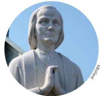
St. John Vianney (1786-1859)

Go, then, to Communion, my children; go to Jesus with love and confidence; go and live upon Him, in order to live for Him! Has not the Divine Savior said, "Come to Me, all you that labor and are burdened, and I will refresh you"? Can you resist an invitation so full of love and tenderness? Do not say that you are not worthy of it. It is true, you are not worthy of it; but you are in need of it. If Our Lord had regarded our worthiness, he would never have instituted His beautiful Sacrament of love: for no one in the world is worthy of it.... Do not say that you are sinners, that you are too miserable, and for that reason you do not dare to approach it. I would as soon hear you say that you are very ill, and therefore you will not take any remedy, nor send for the physician.