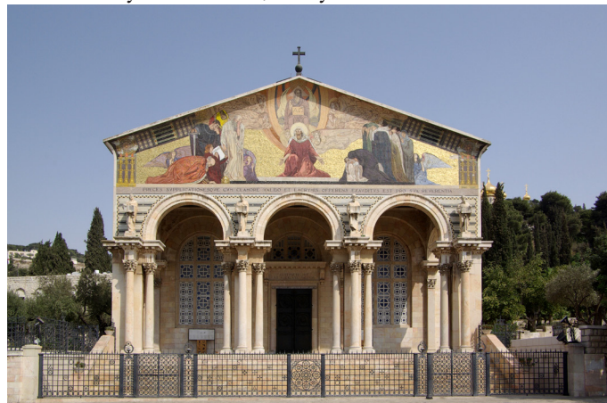
Church of All Nations, Jerusalem

What stands out to me is how Saint Matthew describes the disciples. He notes that there are eleven of them - highlighting that their number has been diminished by the betrayal and suicide of Judas. And although they worshiped Jesus when they saw Him, they doubted.