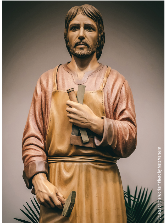
"St. Joseph the Worker"

—Pope Francis, Patris Corde , Apostolic Letter for the Year of St. Joseph