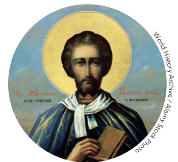
St. Justin Martyr (c. 100-165)