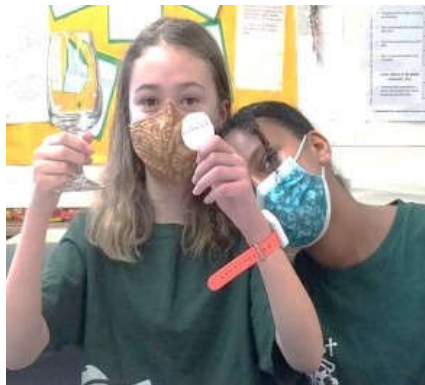
Institution of the Eucharist