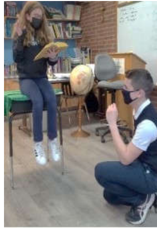
Proclamation of the Kingdom