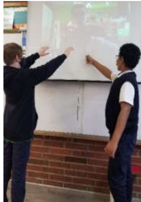
Wedding at Cana