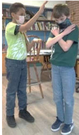
Jesus' Baptism in the Jordan