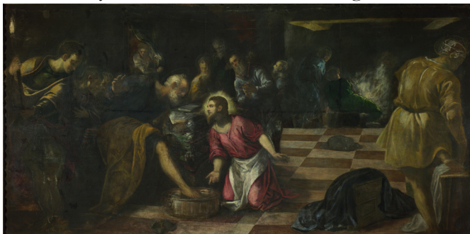
Christ washing the Feet of the Disciples, Jacopo Tintoretto

At first reading, it is tempting to apply this description to those around us - looking to the various authority figures in our lives and echoing Jesus’ evaluation. And while there may be some merit to those kinds of complaints, this is a temptation because it turns the Lord’s words away from their intended target: us!