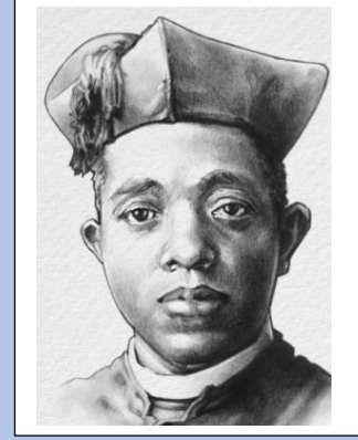
Venerable Father Augustus Tolton