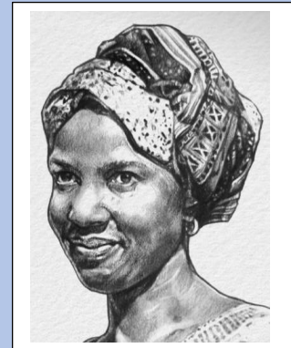
Servant of God Sr. Thea Bowman

Please join The Friends of Saint Francis in a viewing of Formed.org's offering of the Stella Maris Productions, LLC documentary