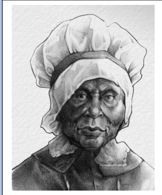
Servant of God Mother Mary Lange